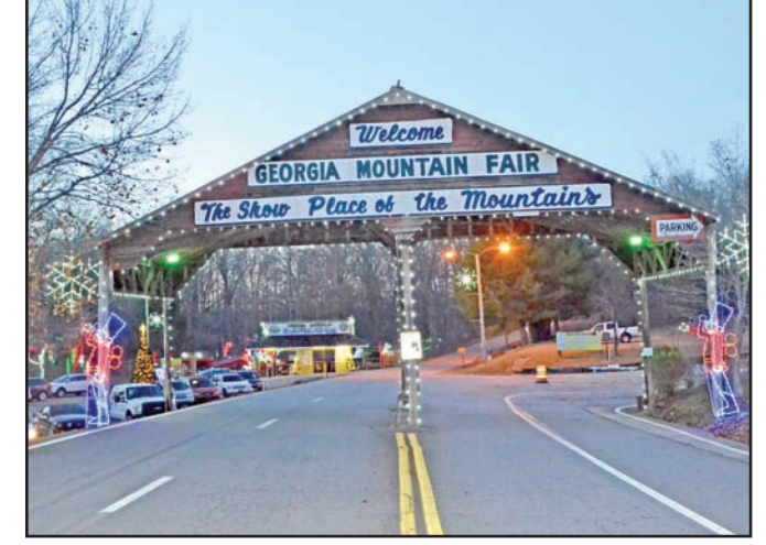
'Mountain Country Christmas in Lights!" at the Georgia Mountain Fairgrounds.

Everything from candied apples to specialty knives to uniquely designed fibers arts are available, proving to offer a little something for everyone.