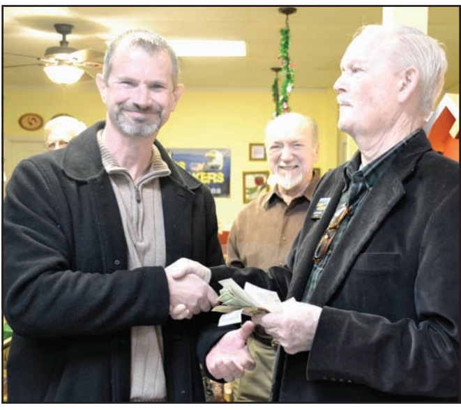
The Mountain Movers and Shakers donated $644 to the sheriff's Empty Stocking Fund.

about this county and I care See Empty Stocking, Page 7A